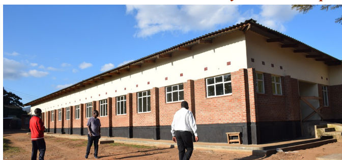
Umodzi ART Clinic at Queen Elizabeth Central Hospital